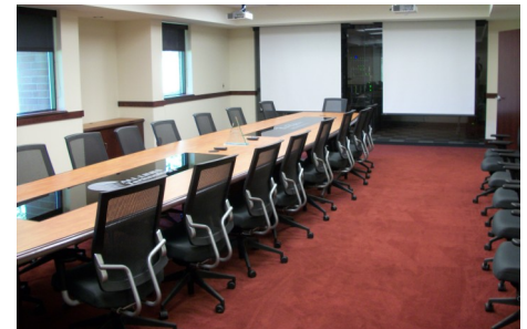
Training and Board Room